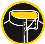
STAND UP COLLAR