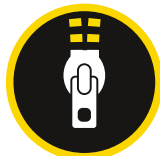
YKK MAIN ZIP LIFETIME WARRANTY